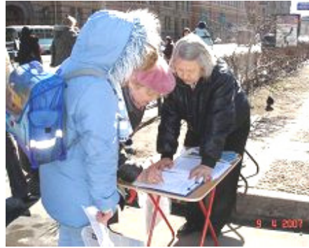
Practitioners explain the facts of the persecution to passersby in Saint Petersburg. People signed the petition to demand human rights for Falun Gong practitioners.

Recently, bowing to pressure and enticement from China's communist regime, the Russian government has repeatedly behaved poorly in dealing with Falun Gong issues. Three years ago, the Moscow authorities designated the square in front of the Chinese Embassy as a restricted area, and any activities for which Falun Gong practitioners applied for permission to hold there were denied. Individual practitioners who staged protests in front of the Chinese Embassy were arrested. Russia's laws stipulate that there is no application needed for individual protests, yet this civil right was violated by the police.